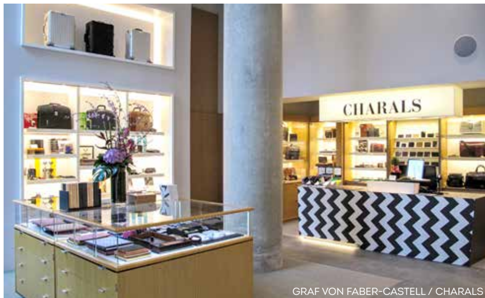
GRAF VON FABER-CASTELL / CHARALS

For a quickie blowout before a big night out (or, simply, a fast-and-furious beauty boost, no very special occasion required), nothing, in our minds, beats Blo. So, naturally, we were delighted to hear that the Vancouver-born blow-dry bar—which famously offers a limited menu of hairstyling services, no cuts, no colour, no ma'am—has joined forces with TOPSHOP to open four new Canadian locations, including one in our very own Hudson's Bay downtown. Access to flawless hair while we shop the latest fashion trends? Sounds like a no-brainer, blo-in-one to us. 674 Granville St. Blomedry.com