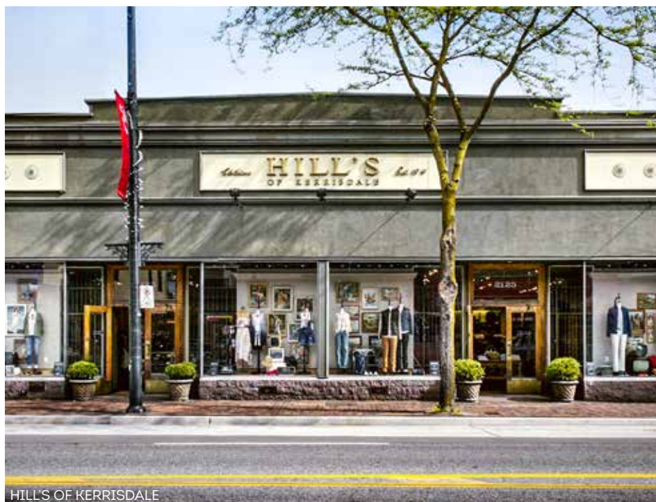
HILL'S OF KERRISDALE

The bookish will delight in Hager Books and The Newsroom —an expansive magazine shop like few left in the city—while gardeners will love florist Thomas Hobbs , which, after 30 years,