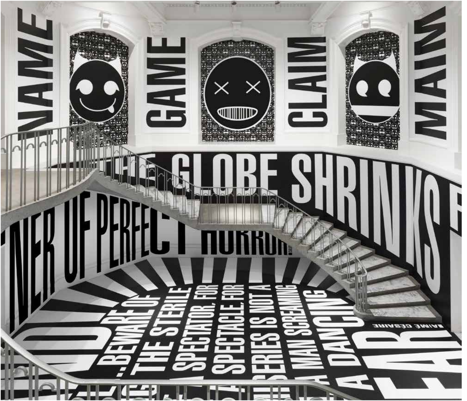
MODART We're incredibly excited for MashUp: The Birth of Modern Culture, a new exhibit that will take over the entire Vancouver Art Gallery with works from edge-pushers such as Basquiat, Picasso, Warhol, Stan Douglas and Tobias Wong. It's all about the mix, right? Opens February 20th.