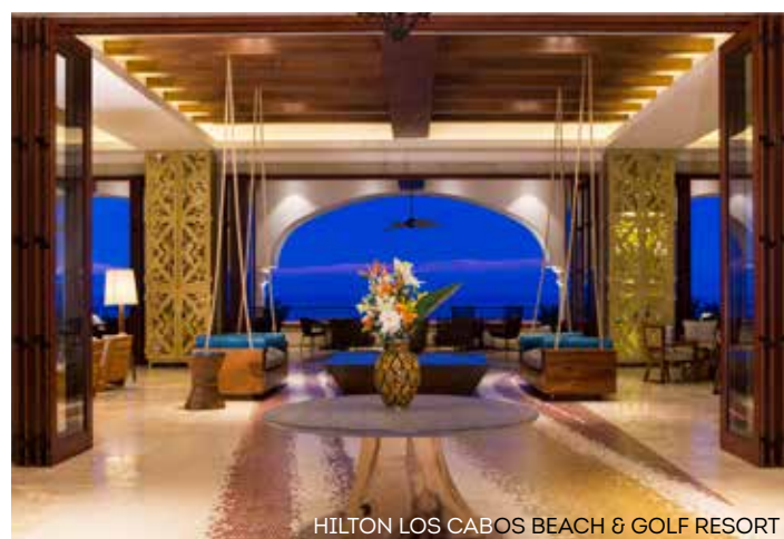
HILTON LOS CABOS BEACH & GOLF RESORT