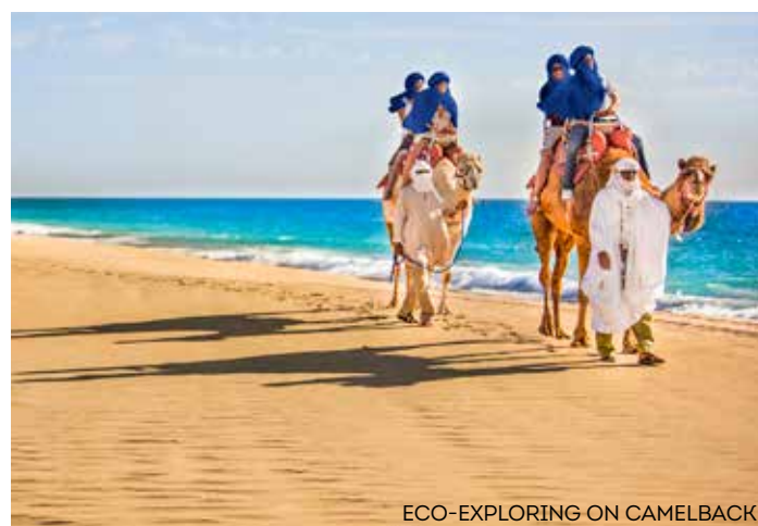
ECO-EXPLORING ON CAMELBACK