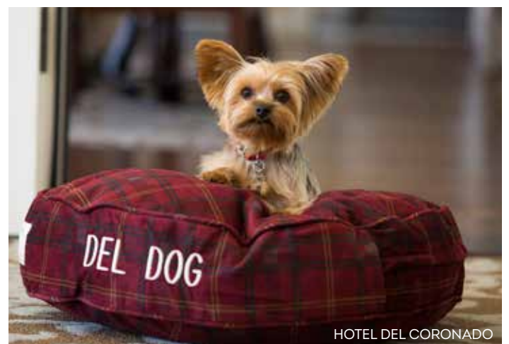
HOTEL DEL CORONADO