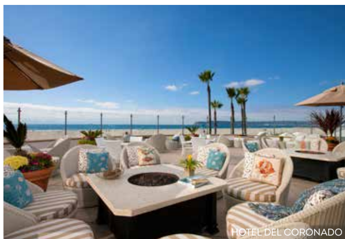
HOTEL DEL CORONADO