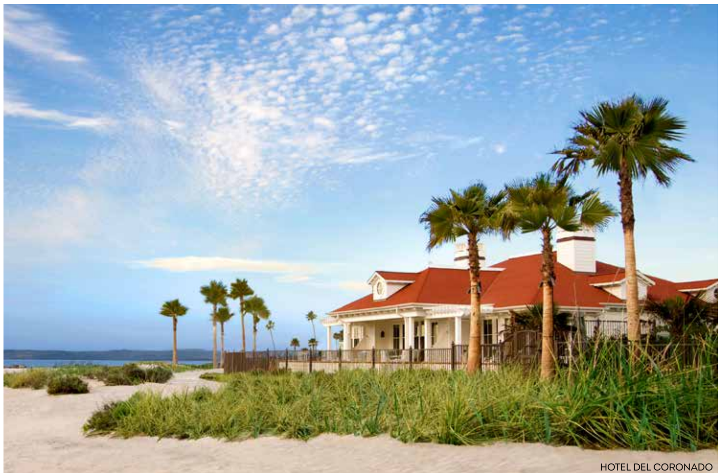
HOTEL DEL CORONADO