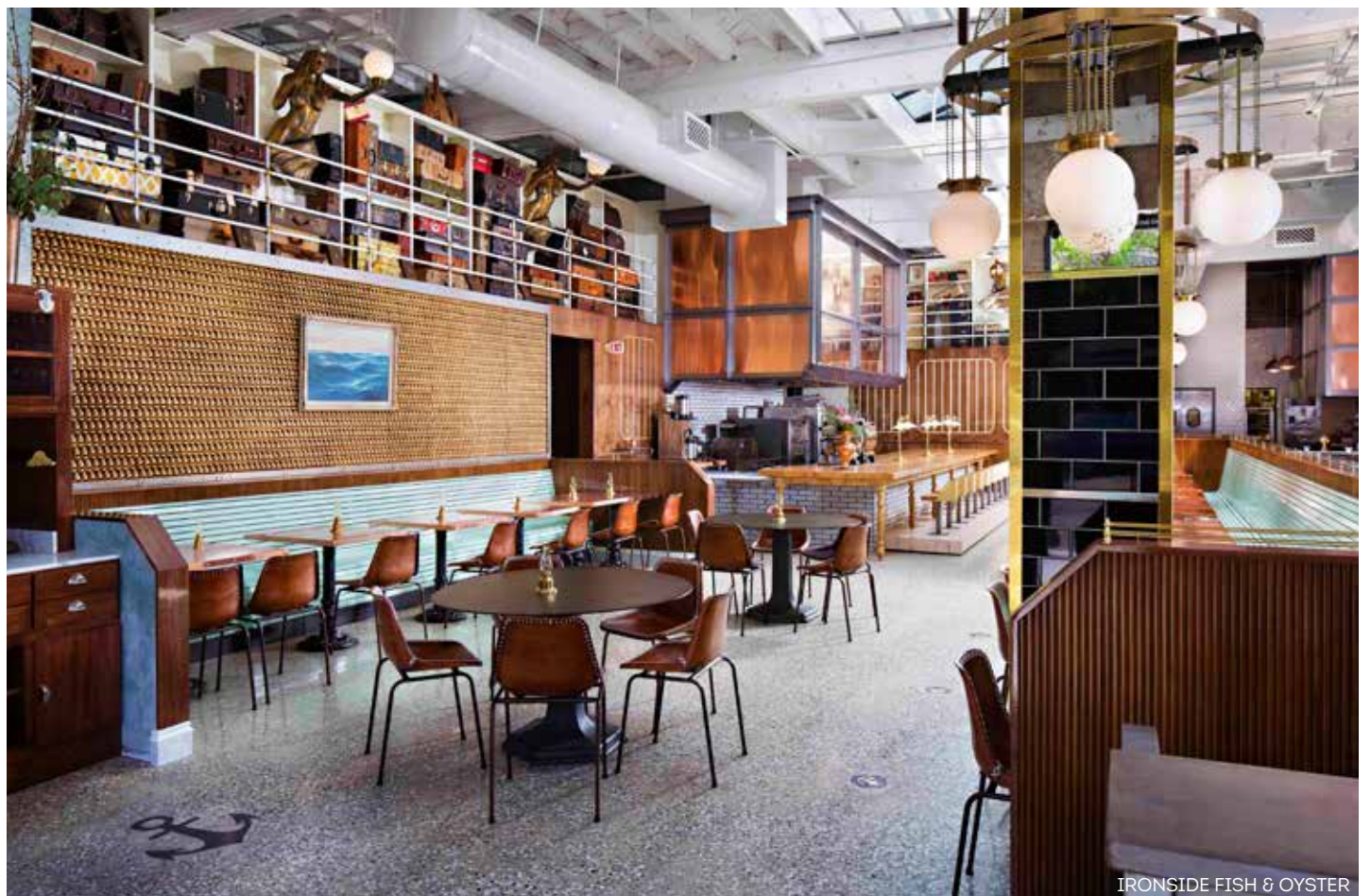
IRONSIDE FISH & OYSTER