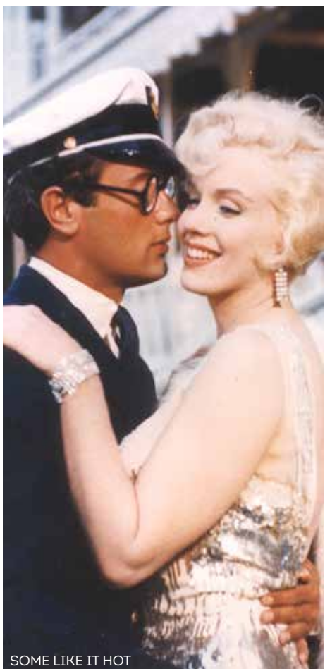
SOME LIKE IT HOT