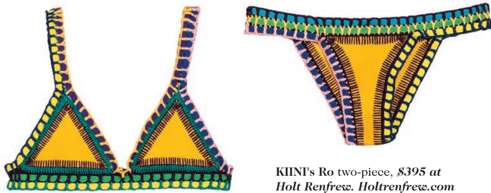
KIINI's Ro two-piece, $395 at Holt Renfrew. Holtrenfrew.com