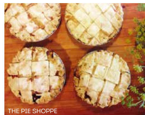
THE PIE SHOPPE

ask) and our favourite Prince of Peace Instant Ginger Honey Crystals (stops springtime colds in their tracks). Clothing-wise, hit El Kartel for street-cool, Blim for creative prints (sushi pants!), Charlie & Lee for the impossibly chic art-girl look and the Board of Trade for Hansel from Basel socks, which are expensive but the coolest ever.