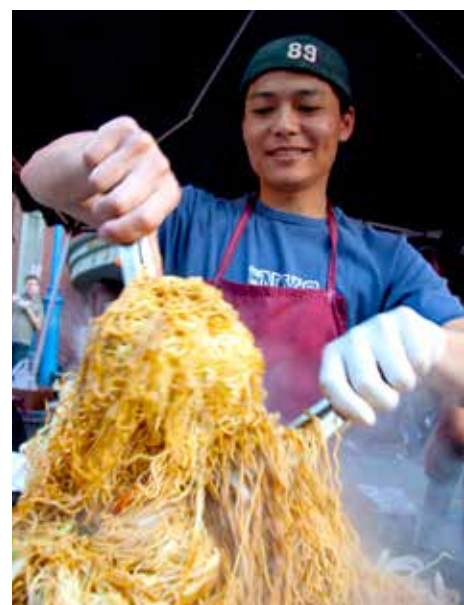
TOURISM VANCOUVER/DANNIELLE HAYES