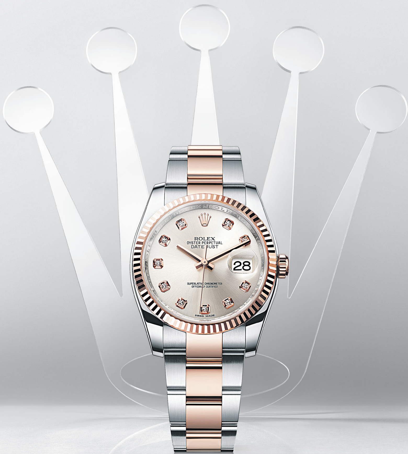
OYSTER PERPETUAL DATEJUST 36

The archetype of the modern watch has spanned generations since 1945 with its enduring functions and aesthetics. It doesn't just tell time. It tells history.