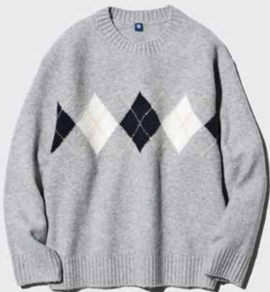
Soufflé Yarn Sweater

FOR MORNINGS WHEN YOU WANT YOUR CHILD TO LOOK POLISHED WITHOUT THE FUSS , the Rugger Polo Shirt is a lifesaver. Crafted from thick 100 per cent cotton yarn with a wrinkle-resistant jersey collar, this relaxed-fit staple looks sharp straight out of the drawer. Whether it's picture day, a classroom presentation or just a regular Tuesday, this polo strikes the perfect balance of neat and casual. $29.90