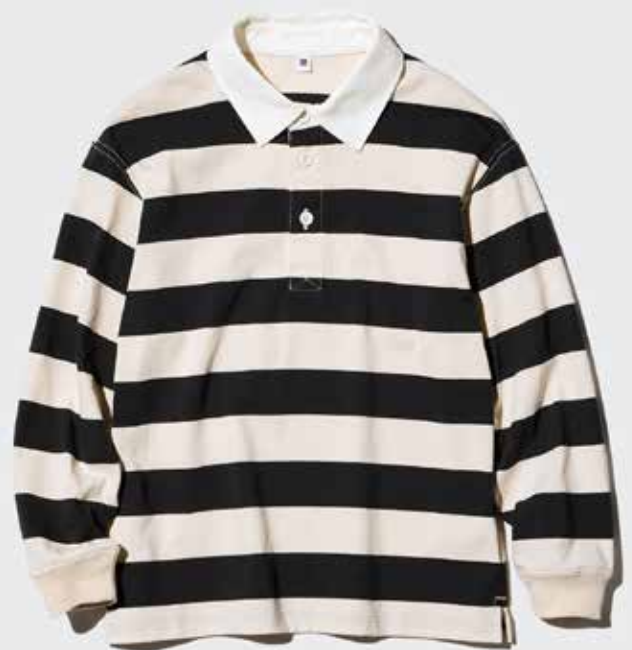
Rugger Polo Shirt

FOR MORNINGS WHEN YOU WANT YOUR CHILD TO LOOK POLISHED WITHOUT THE FUSS , the Rugger Polo Shirt is a lifesaver. Crafted from thick 100 per cent cotton yarn with a wrinkle-resistant jersey collar, this relaxed-fit staple looks sharp straight out of the drawer. Whether it's picture day, a classroom presentation or just a regular Tuesday, this polo strikes the perfect balance of neat and casual. $29.90