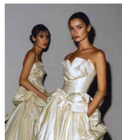
STYLE Here Comes The Vintage Bride