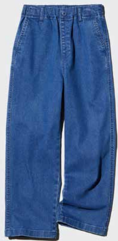
Stretch Easy Pants Denim

SCHOOL DROP-OFFS IN THE DRIZZLE? Weekend soccer games in the chill? The PuffTech Washable Vest has you covered. Lightweight yet warm, it's finished with a water-repellent coating to handle light rain and is machine washable (a parent's dream). Layer it over a sweater or hoodie, and you've got a transitional piece that works from September through spring. $49.90