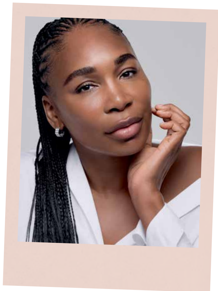
Above: Serena Williams for Dior. Left, Below: Charlize Theron for Dior.

Pro-Collagen Shot takes that breakthrough a step further by introducing a new biotechnological collagen fragment, 27 times smaller than the marine collagen often found in cosmetics. This fragment, biomimetic in design, is recognized instantly by the skin's cells, encouraging them to produce four major types of collagen—types I, III, IV and VII—that collectively account for 90 per