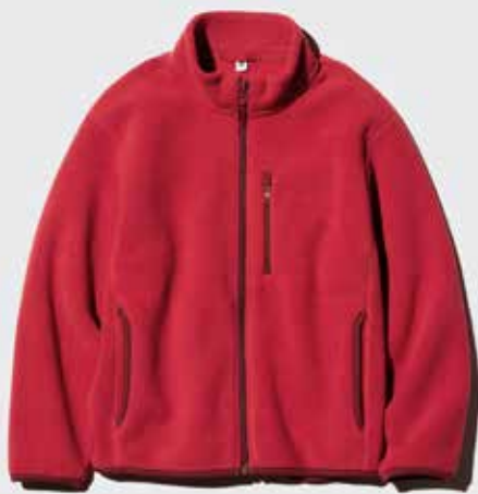
Fleece Full-Zip Jacket

EVERY PARENT KNOWS LAYERS ARE THE SECRET TO SURVIVING SCHOOL DAYS that start chilly and end sunny. This lightweight fleece jacket is the perfect grab-and-go option. Easy to zip on and off, it works indoors or outdoors, over uniforms or play clothes. It's warm, versatile and the kind of piece kids can throw on themselves—because independence counts. $34.90