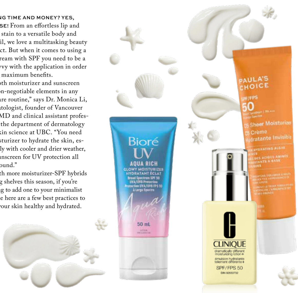
From Left Bioré UV Aqua Rich Glow Moisturizer, Clinique Dramatically Different Moisturizing Lotion+, Paula's Choice SPF 50 C5 Broad Spectrum Moisturizer

TOUCHY SUBJECT(S) “If you have sensitive skin, you may want to use a separate moisturizer and sunscreen, as it may help distinguish if either formula is causing skin issues or intolerance,” recommends Li. Ingredients such as UV filters, fragrances or preservatives are common potential irritants for those with reactive skin. She also notes that mineral sunscreen filters, such as titanium dioxide and zinc oxide, tend to be a better fit for sensitive complexions. V