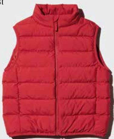
PuffTech Washable Vest

SCHOOL DROP-OFFS IN THE DRIZZLE? Weekend soccer games in the chill? The PuffTech Washable Vest has you covered. Lightweight yet warm, it's finished with a water-repellent coating to handle light rain and is machine washable (a parent's dream). Layer it over a sweater or hoodie, and you've got a transitional piece that works from September through spring. $49.90